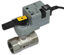
Trane Control Valve (Option)