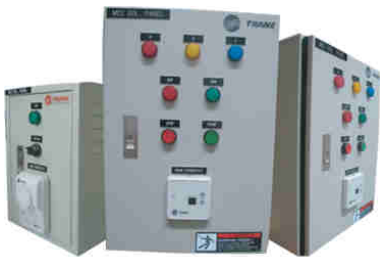
AHU Starter Panel (Option)