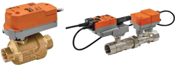
PICV Valve (Option)