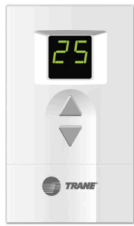
Proportional Thermostat (Option)