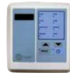
New Digital Wired Display