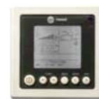
Digital Room Thermostat